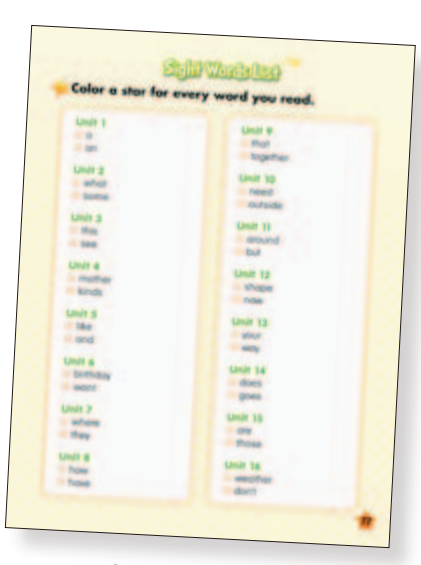
Sight Words List