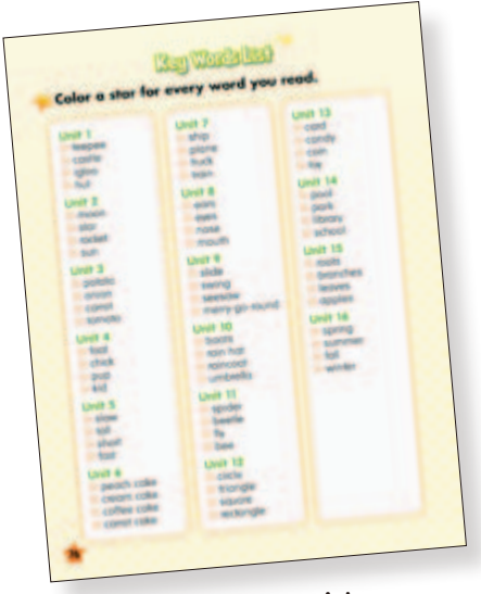
Key Words List

Students can review all of the words they have learned in each unit. They can build confidence by keeping track of how many words they learn in total.