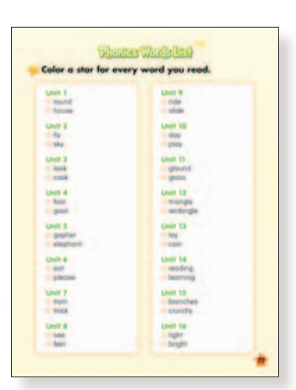
Phonics Words List